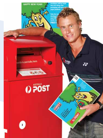
Lleyton Hewitt, Cards 4 Planet Ark Ambassador