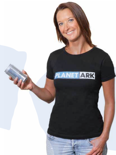
Layne Beachley, Aluminium Can Recycling Ambassador